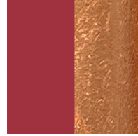
Purple Red / Copper Leaf - PRC