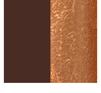
Coffee / Copper Leaf - CCL