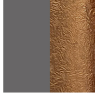
Metallic Anthracite / Bronze Leaf - MAB