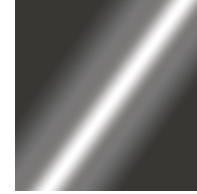
Aluminum - ALU